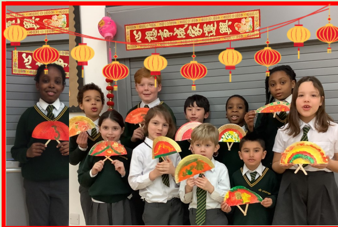
After-school club made lovely fans to celebrate Chinese new year.